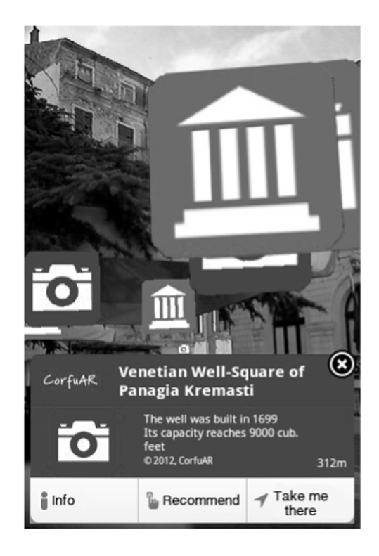
Fig. 3. CorfuAR travel guide in action.

The size of each POI's icon is dynamically changing according to the distance of users from that POI. The larger the icon, the closer the user is to the POI (Fig. 3). All POIs are displayed as gray 2D icons, apart from the personalized ones that are displayed as colored 2D icons. We use three different colors (red, green and blue) corresponding to three users' groups with common preferences produced by the users' segmentation process described in Section 4.