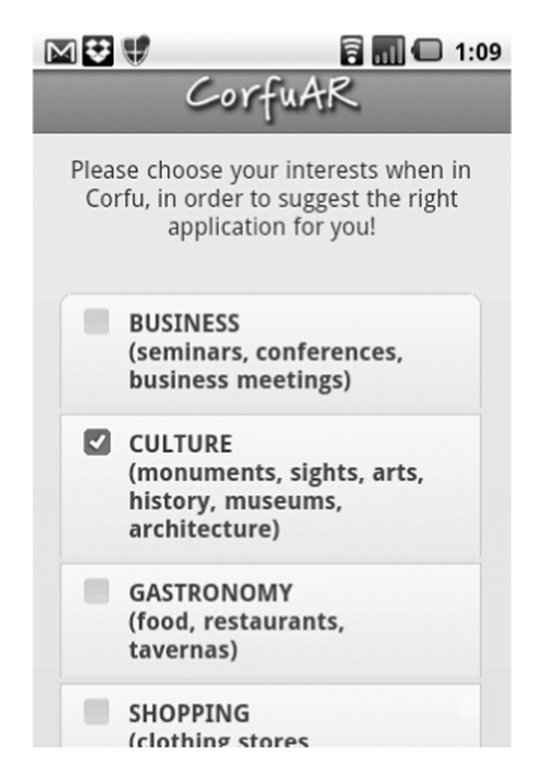
Fig. 5. Sample of the activity-related questionnaire for discovering the user's profile.